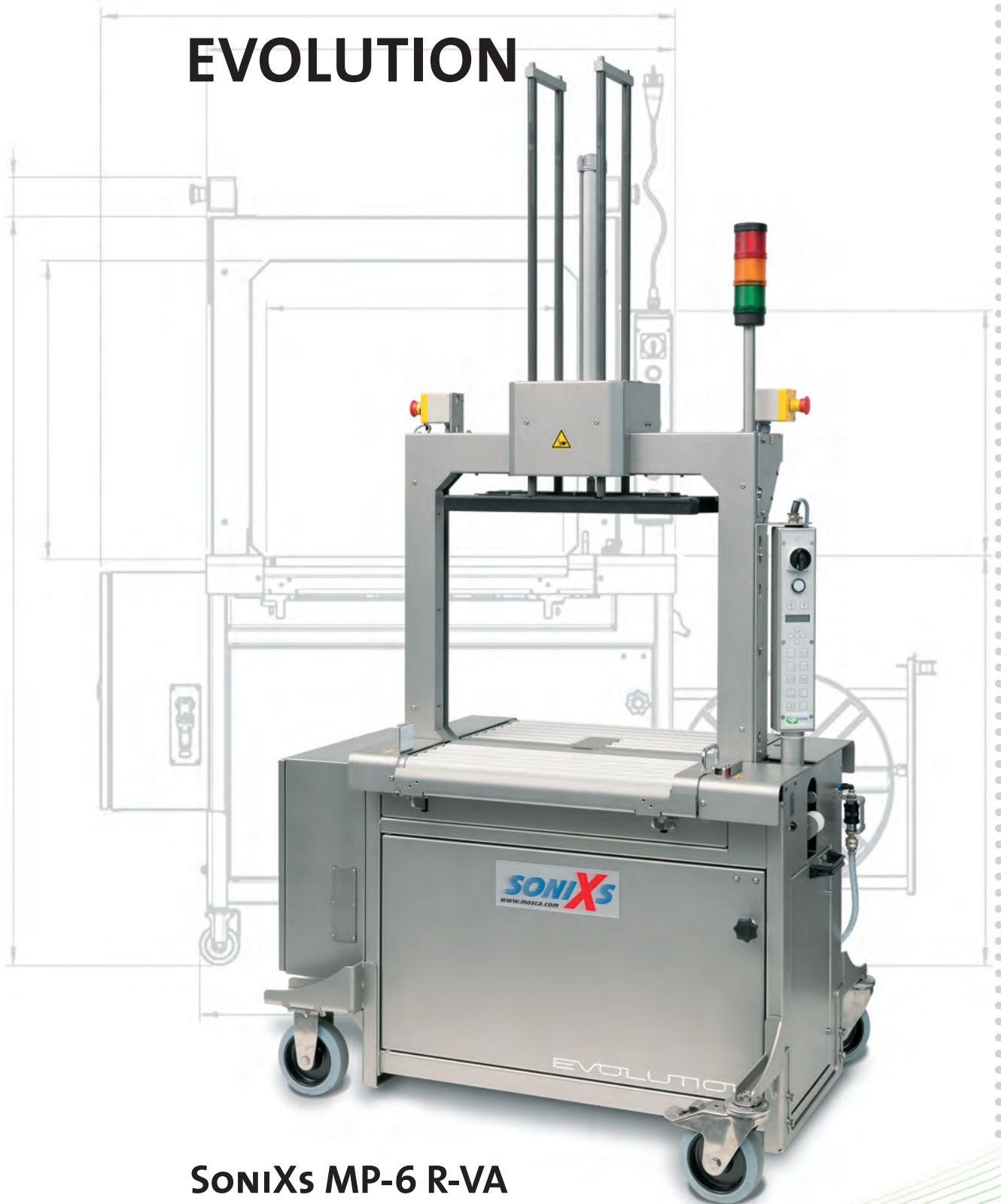
SONIXs MP-6 R-VA Fully Automatic Stainless Steel Strapping Machine